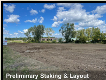
Preliminary Staking & Layout