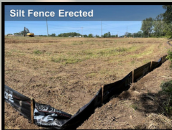
Silt Fence Erected